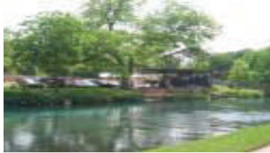
The Guadalupe River flows along the eastern edge of the New Life residential facility.

The facility has begun plans for major site renovations that include an agricultural complex and sports fields, new maintenance and administration buildings, and school additions to include more classrooms and a full-scale library.