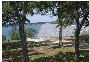
Canyon Dam controls the depth of the lake, regulating spills into the Guadalupe River.

Canyon Lake, a popular recreational attraction, is known for its fishing and boating. The lake encompasses more than 8,300 acres.